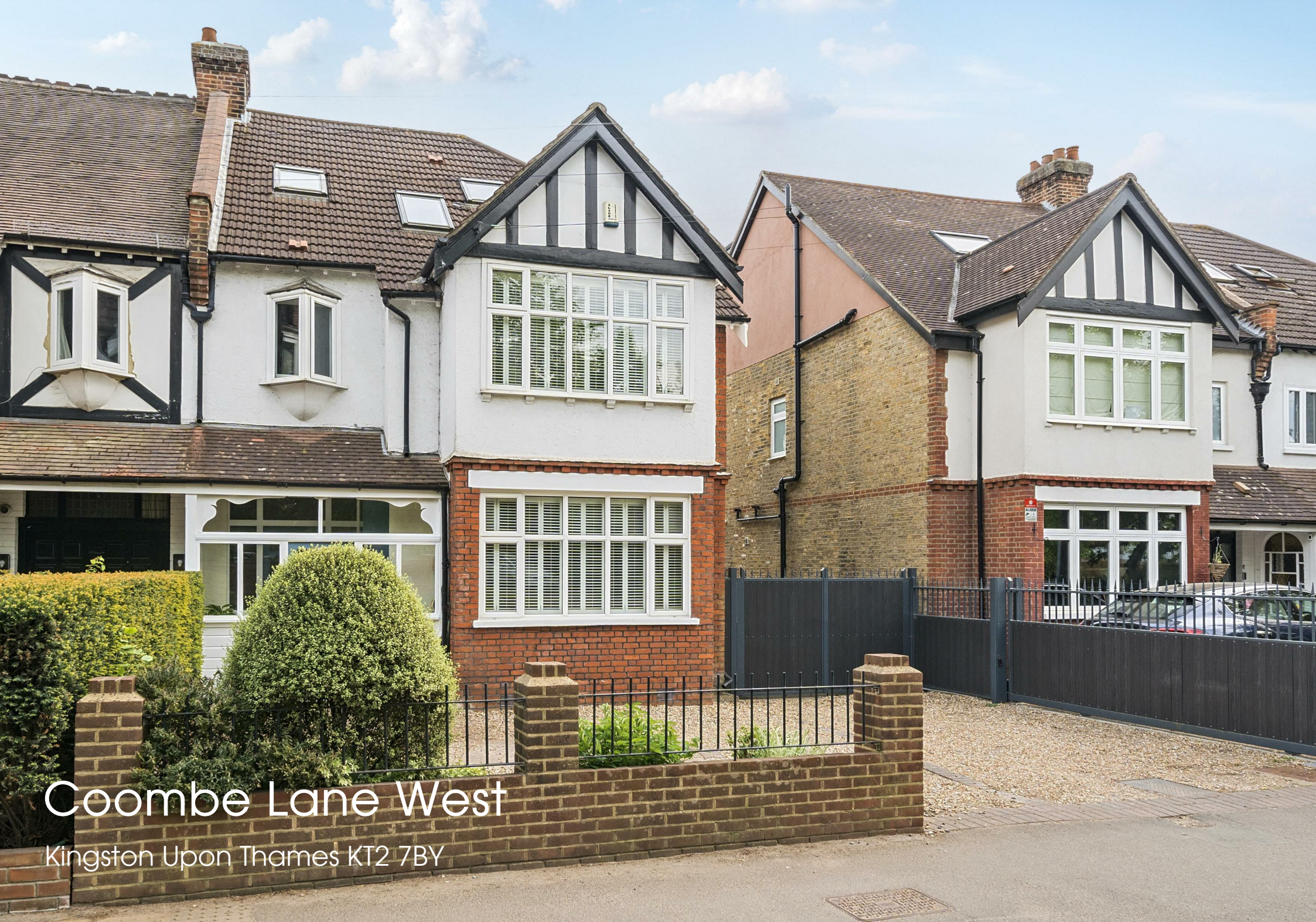
Coombe Lane West Kingston Upon Thames KT2 7BY